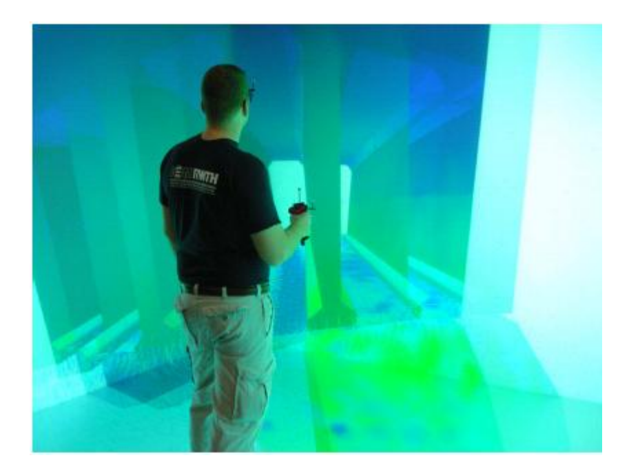
Fig. 2. Virtual reality (VR) environment. Electromechanical device presented in a VR-cave.

Fig. 1. Multi physics model environment involving magnetic field interaction with electric circuits of a power electronic circuit, mechanical transmission devices such a s a gear, structure dynamic effects excited by magnetic forces, forces introduced by mechanical forces and other parasitic effects such as magnetic and electric losses (Multi physics environment IEM RWTH Aachen University, www.iem.rwth-aachen.de ).